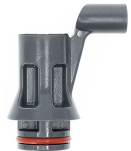
Piston Stem for PGK - Flex Compatible

Part #: 7X791819B SKU: 797822791819 MSRP: $5.50