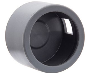
Pressure Gauge Guard

Part #: 7X822623B SKU: 691034822623 MSRP: $3.20