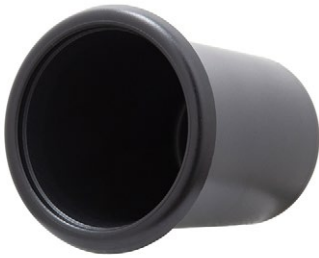
Dosing Cup and Tamper, Standard

Part #: 3P822487N SKU: 691034822487 MSRP: $16.00