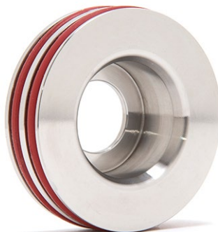
Stainless Steel Plunger for PGK

Part #: 3X147889N SKU: 647213147889 MSRP: $13.00