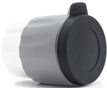
Preheat Cap Standard Brew Head

Part #: 4X148138G SKU: 647213148138 MSRP: $5.00