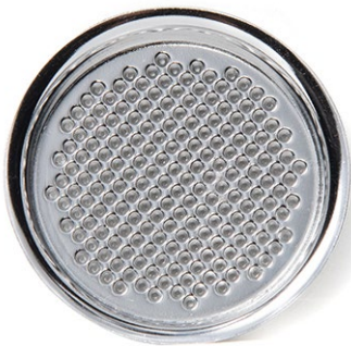
Stainless Steel Dispersion Screen

Part #: 3N148039R SKU: 647213148039 MSRP: $24.00