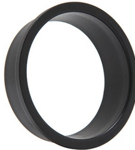
Adaptor Ring for PF Base

Part #: 7X147827B SKU: 647213147827 MSRP: $5.50