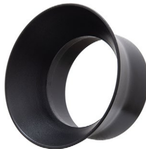
Filling Funnel, Standard

Part #: 4X210226B SKU: 608816210226 MSRP: $8.00