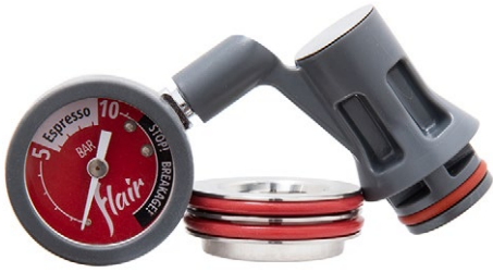
Flex Compatible Pressure Gauge Kit (with angled stem)

Part #: 2F113930N SKU: 691034822418 MSRP: $56.00