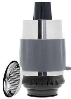
Second Shot Plus Kit, Standard, w/ SS Screen & Plunger

Part #: 2F113930N SKU: 691034822418 MSRP: $56.00