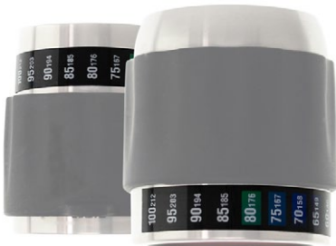
High Heat Temperature Strip

Part #: 2X148244N SKU: 647213148244 MSRP: $73.00