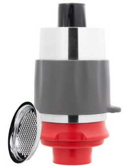
Second Shot Plus Kit, Flow-Control 2 Portafilter, w/ SS Screen

Part #: 2X822203N SKU: 691034822203 MSRP: $73.00