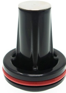
Piston, Polyacetal - Flair Classic Only

Part #: 2X791826N SKU: 797822791826 MSRP: $29.00