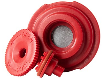
Flow-Control 2 Portafilter

Part #: 3X241278B SKU: 860006241278 MSRP: $24.00