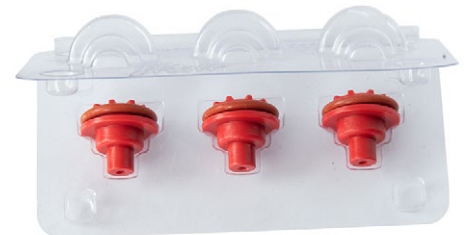
Flow-Control 2 Spout Kit (3 Spouts)

Part #: 2X822470N SKU: 691034822470 MSRP: $27.00