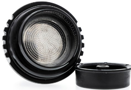
Bottomless 2-in-1 Portafilter

Part #: 6X210141N SKU: 608816210141 MSRP: $4.50