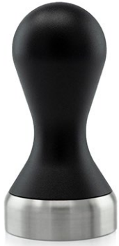
Stainless Steel Tamper, Standard

Part #: 2X791826N SKU: 797822791826 MSRP: $29.00